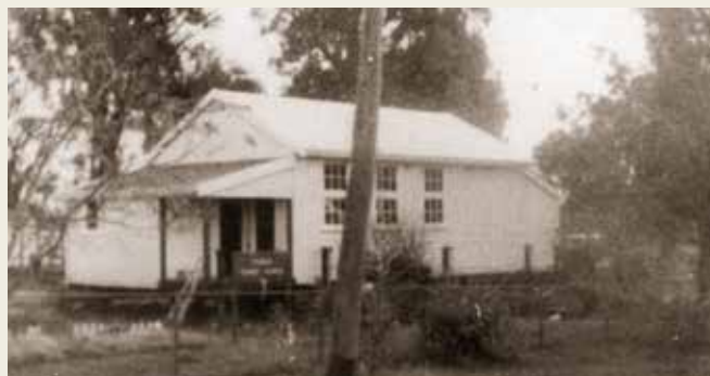
Yornup Primary School

Alongside the school building stood the vital rain water tank. Most schools cultivated a winter garden as part of their course in nature study. Today, exotic vegetation still flourishes on school sites as evidence of these activities.