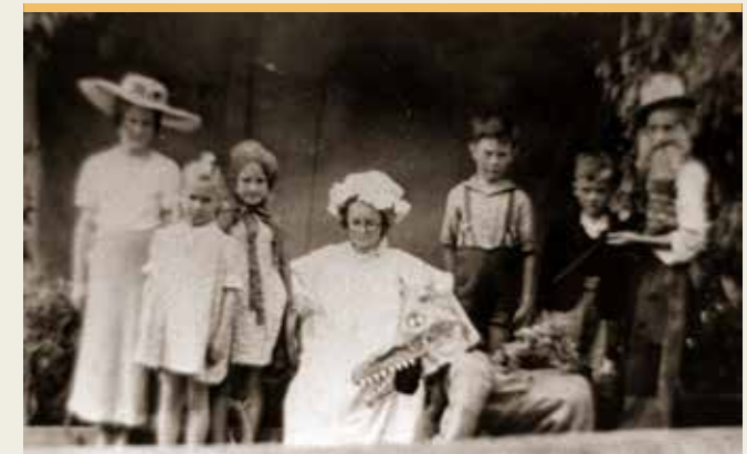
Kangaroo Gully School Concert in the mid 1940s

A Government School Inspector often visited ‘little schools’ in the district to assist teachers with the varied grades they were teaching within a single class room. The School Inspector would also assess students’ work and the conditions of each school.