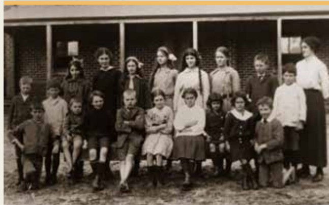
Teacher and pupils outside Winnejup School in the early 1900s

within 3miles (4.8km) of a school was required to warrant a full time school. If the numbers diminished permanently, a ‘little school’ could be reclassified as an Assisted School; functioning on a part time basis in conjunction with another school located close by, a little school could be closed; transferring the pupils to another school or students could take correspondence lessons at home (a Government initiative commencing in 1919).