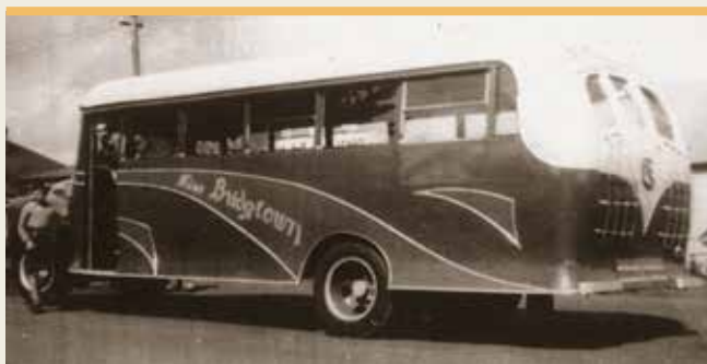
School bus service

During the early years many 'little schools' closed temporarily, only to reopen as a new generation of children reached school age. 'Little schools' disappeared altogether for a number of reasons including; low pupil attendance, student transfer, teacher illness and fire damage forcing the closure of the Tea Tree School for example, however, the most significant factor for the complete closure of the districts 'little schools' was the advent of the school bus system in 1944, which provided an efficient means of transport for children to attend schools in main town centres, such as Bridgetown and Greenbushes.