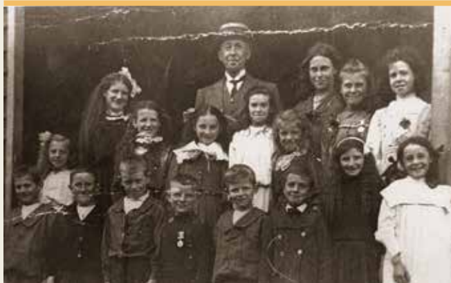
Glenlynn- Sunnyside School, photo taken on the School’s porch during October in 1912

One of the major concerns for parents, teachers and the Education Department was the maintenance of satisfactory pupil attendance figures. An average of 10 pupils aged between 6 and 14 years residing