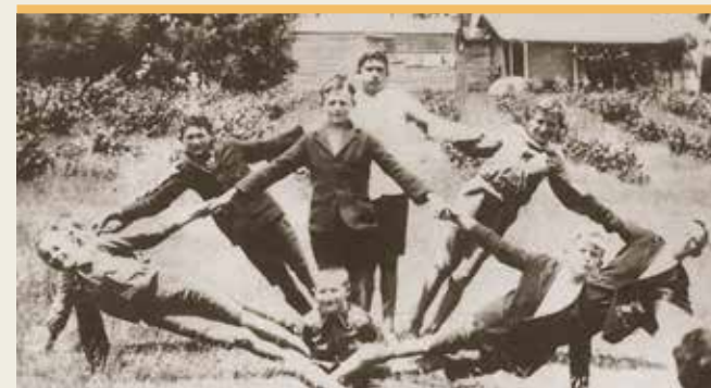
Pupils from the Wandillup School